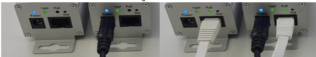
Both devices connected with each other.